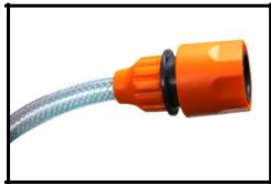
Easy install hose